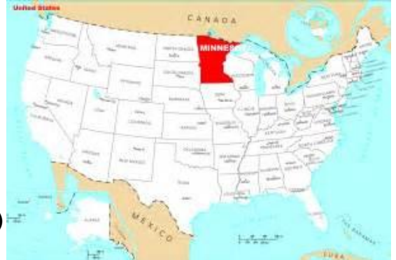
Minnesota On the Map