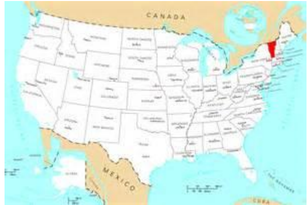
Vermont on the map